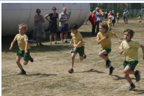
Sprint races at Sports Day