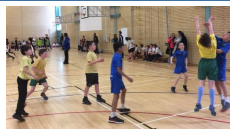
Meadlands basketball team in the Richmond Schools semi-finals