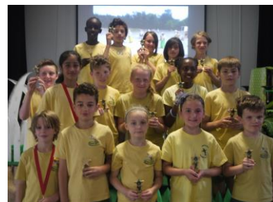
Sports Personality of the Year award winners 2018!