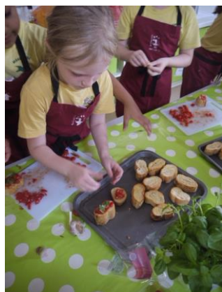
KS1 cooking healthy snacks