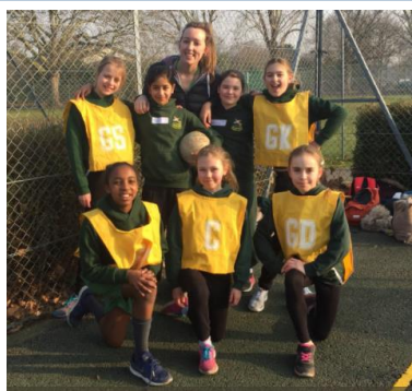
Year 5/6 netballers at the Richmond schools tournament