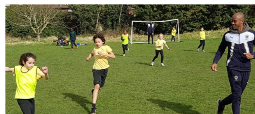
KS2 children training with coaches and players from AFC Wimbledon