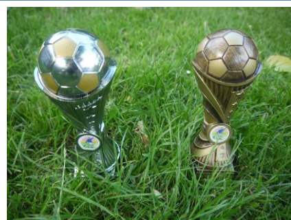
Girls and Boys Winner trophies received during a tournament with St Richards for all children in KS2