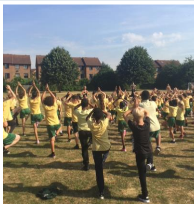
Whole school yoga during Healthy Living Week