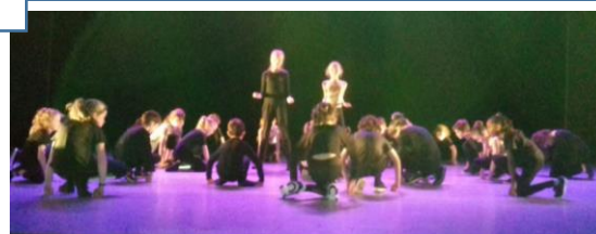
KS2 Dance club performing at 'Richdance'