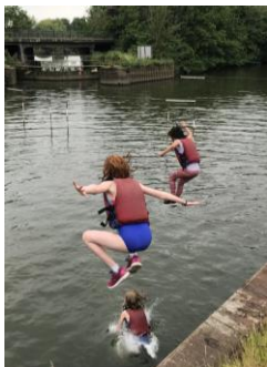
Y4 children experiencing outdoor and adventurous activities at TYM