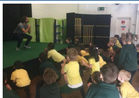
Joe Wicks ('The Body Coach') leading whole school fitness training